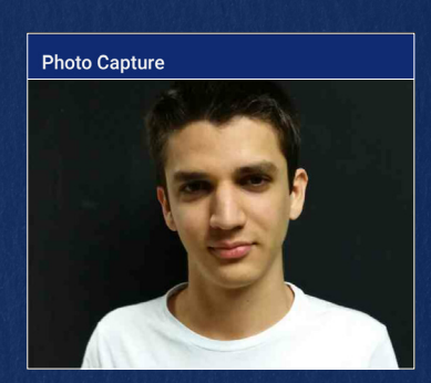
Capture employee photo at clock in/out, meal periods and rest breaks.

For more information please contact our sales team below: