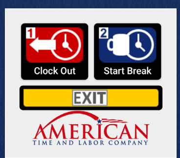
Red icon identifies to employee that they are now clocked in.