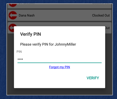
Use PIN numbers for easy shared access to clock in/out functionality.